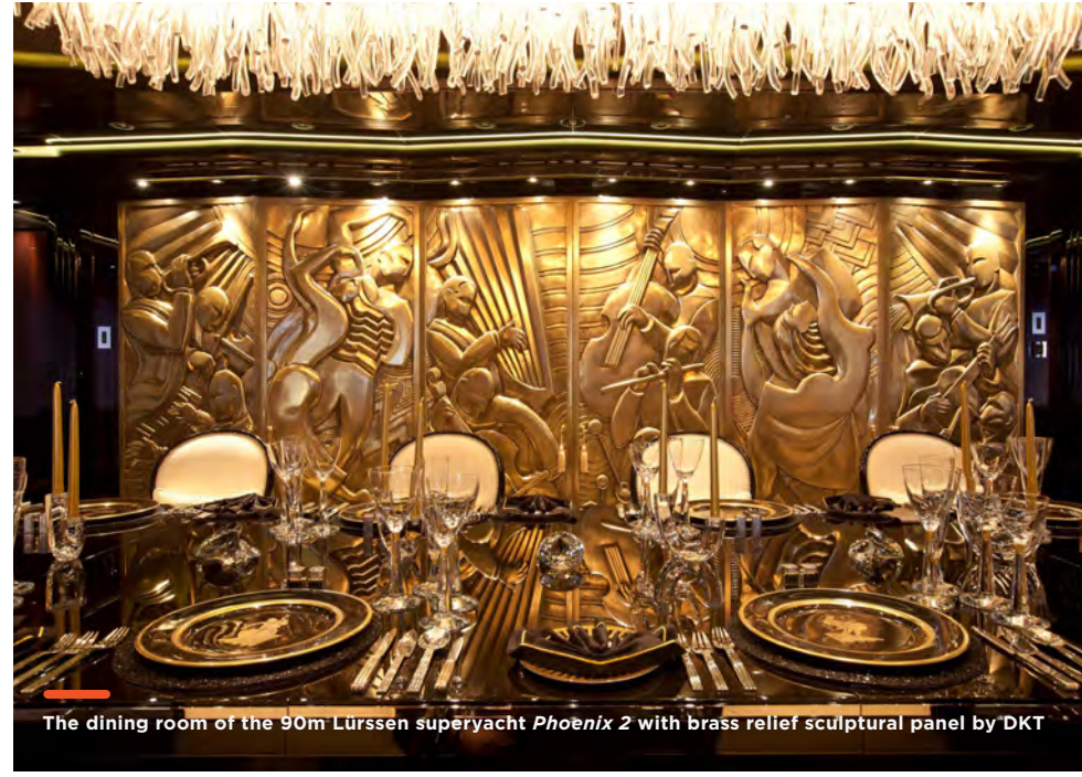
The dining room of the 90m Lürssen superyacht Phoenix 2 with brass relief sculptural panel by DKT BREED MEDIA

When stepping aboard a superyacht, awe and intrigue often envelop guests and owners in a world where artistic mastery intertwines seamlessly with functional, luxurious living. Behind the scenes of these floating wonders, a select group of exceptionally skilled artisans weave their magic, evoking and echoing artistry often found within the walls of historical homes, city-scape penthouses, and palatial real estate. From meticulously gilded detailing conceived from centuries-old archeology, to hand-painted glass staircases that appear to float in mid-air and decorative displays of bespoke Murano glasswares hand-blown in Venice, every element is a testament to the unyielding pursuit of perfection, poised to conceptualise a designer or owners wishes.