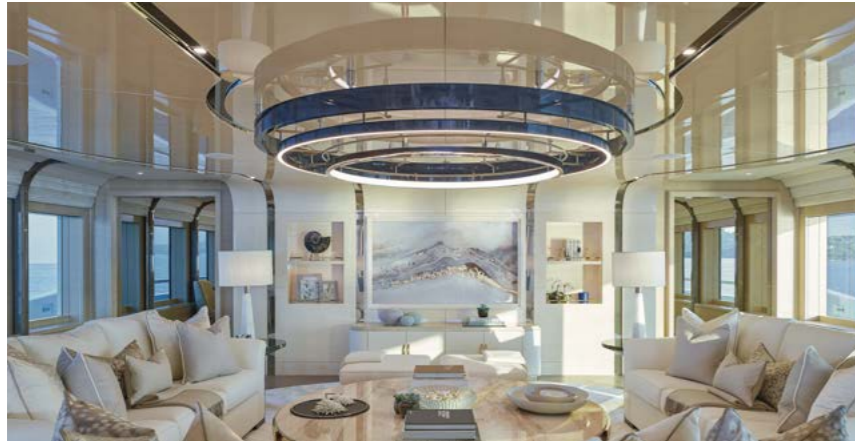
Art On Superyacht