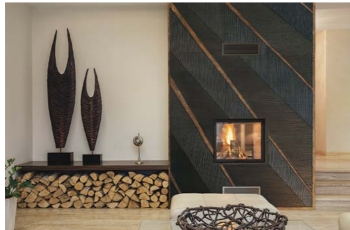
Carved Wood Art In Residence